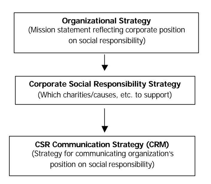
Figure 2. Strategic processes related to corporate social responsibility driven by the organization's mission statement.